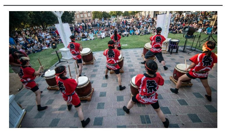
20th Annual Otsukimi Moon Viewing Festival Marks an Exciting New Chapter in the Event's History.

Sponsorship packages and tickets are still available for purchase, but are in limited supply! Please call us at 214-342-2022 if you would like to register. You can learn more about tickets and sponsorship opportunities online by clicking here.