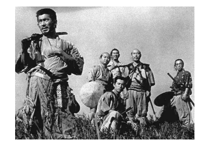
Texas Theatre: Kurosawa's "Seven Samurai" - 35mm Sunday, October 6 | 2:00 pm - 5:30 pm Texas Theatre (Map) 231 W. Jefferson Blvd. Dallas. TX 75208

The Japanese classic from director Akira Kurosawa returns to the big screen in 35mm for an exclusive oneday event! When a village is threatened in 16th century Japan, the locals hire the eponymous warriors to protect them. Weaving philosophy, entertainment, and human emotion into a narrative masterpiece, this enduring epic is one you won't want to miss.