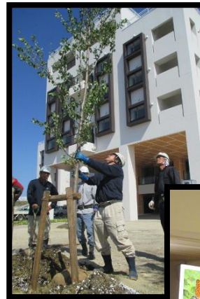
Dallas-Sendai Friendship Tree at Mori no Sato

Accommodations: Hotel JAL City Sendai [Meals: B, L]