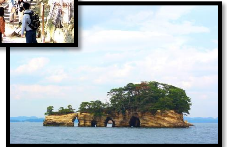
One of Matsushima's pine islands