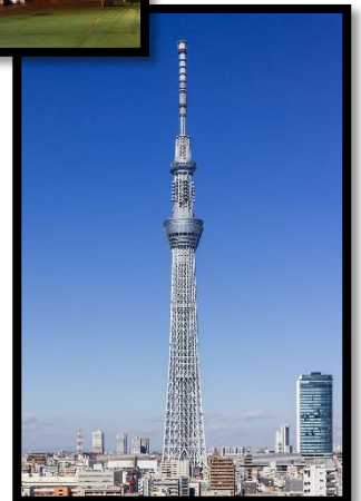
Tokyo Sky Tree