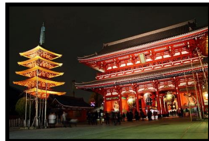
Sensoji Temple in Asakusa